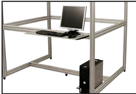
CPU and keyboard stands