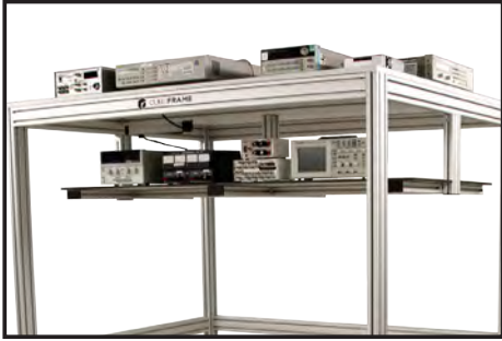
A place for every instrument and every instrument in its place