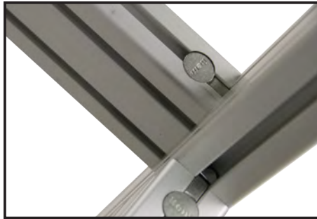
Tough and stable mechanical structure