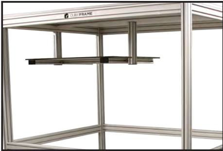
Custom designed / custom made