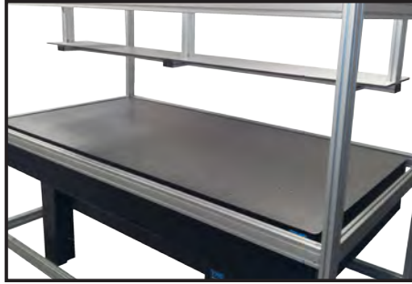
Floating structure that does not affect the optical table