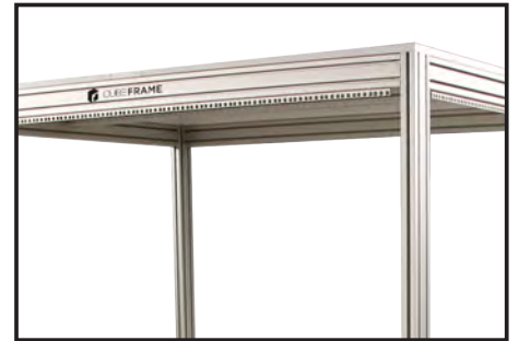
Safety curtain supports